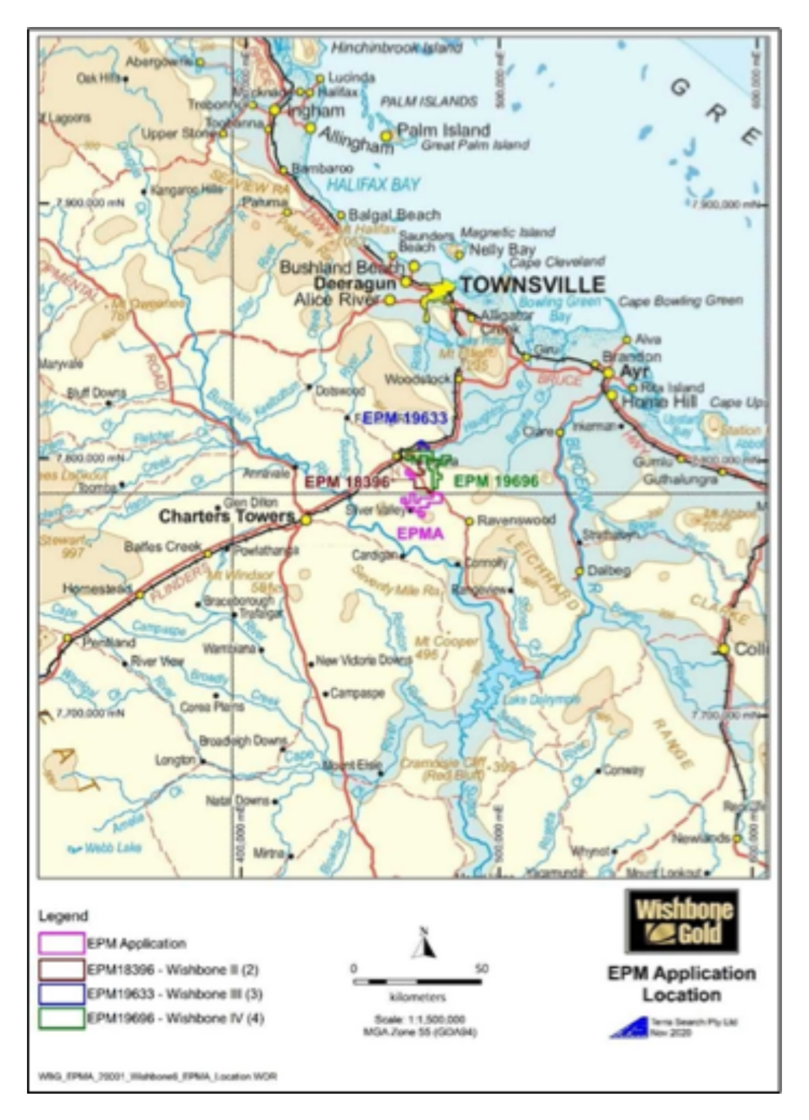
Figure 1: Location map. Wishbone VI EPMA in relation to other EPMs held by Wishbone Gold Pty Ltd Mingela area, North Queensland.