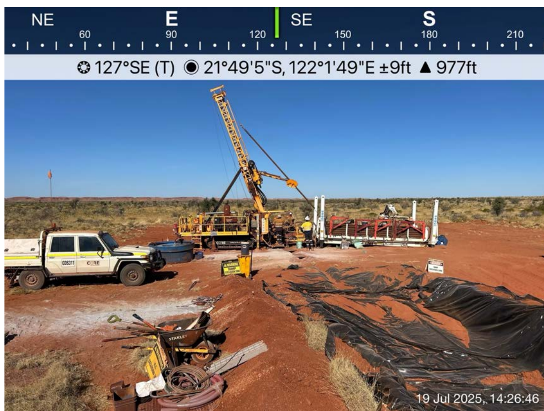
Figure 1: Drillers on site at Red Setter preparing to deepen previous drilled RC hole to target depth of 550m.

Ed Mead, Wishbone Gold WA director, commented; " Access routes have now been opened, and the drillers have mobilised to site and established the necessary site works to drill. As of yesterday, the rig was over the first of two drill holes that are to be deepened from around 300m depth down to around 550m target depth and had successfully run casing to near the bottom of the first hole. We expect further drilling towards the new target depths in the days ahead. "